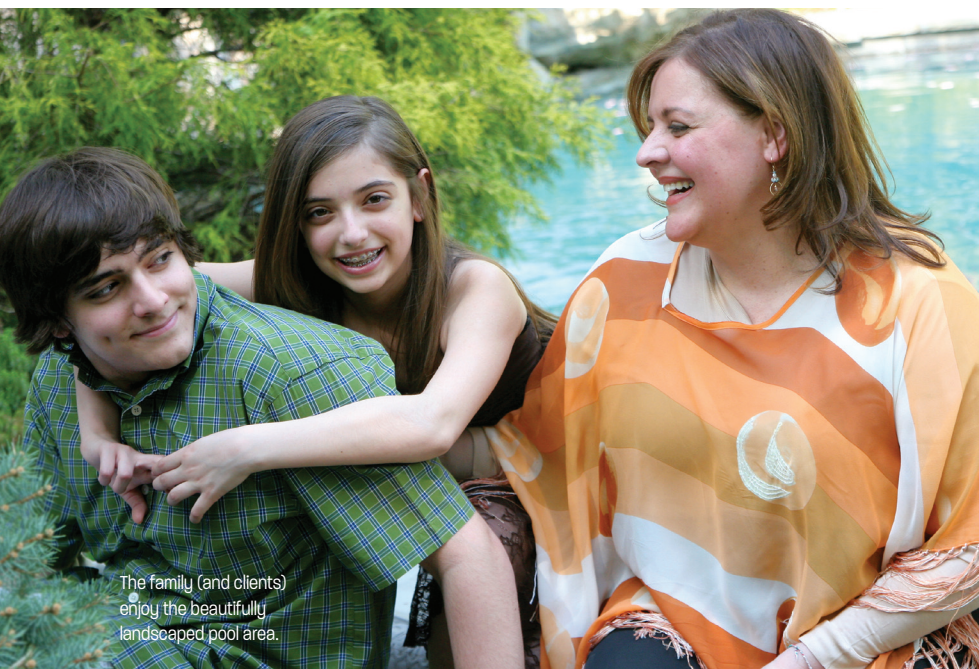
The family (and clients) enjoy the beautifully landscaped pool area.

with plush furnishings, luxurious fabrics, and sparkling fixtures. In all, the wellness studio sprawls across 3,000 square feet. On the beautifully landscaped property outside, there's even a swimming pool—available to clients before or after their treatments.